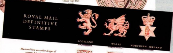
SCOTLAND WALES NORTHERN IRELAND

Illustrated here are earlier designs of country definitive stamps. The Scottish stamps featured the saltire, the thistle, and two unicorns supporting the royal arms of Scotland - a lion banner and a saltire banner. The Welsh stamps portrayed the Dragon of Wales and also showed a leek. The Northern Ireland stamps featured the Red Right Hand of Ulster and some flax.