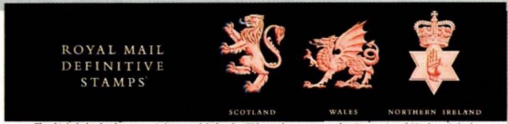
SCOTLAND WALES NORTHERN IRELAND

The thistle badge has been extensively used since the reign of King James III (1489-93), whereas the saltire was formally recognised as a national badge at least a century earlier. Associated with a crown, they both became royal badges and, as such, have appeared on earlier definitive stamps. The two uniforms featured on the highest value of the earlier stamps are the supporters of the royal arms of Scotland. Each holds a lance, the one on the left is supported by a lion banner and the one on the right by a saltire banner.