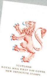
SCOTLAND ROYAL MAIL FIRST DAY COVER NEW DEFINITIVE STAMPS