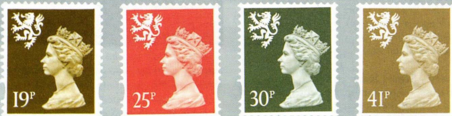
Only the above were available at the time of publication.