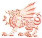
CYMRU AMLEN DWYNOOD CYNTAF Y POST BRENHINOL STAMPIAU DIFFINIOL NEWYDD WALES